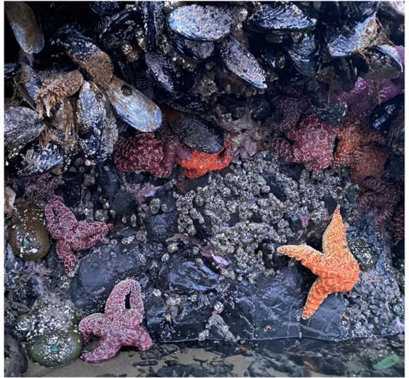
Mussels, Sea Stars, Anemone and more at Haystack Rock

Please consider changing your trajectory and become part of the effort to make our local ecosystems stronger and not set the effort back by stealing "free" mussels.