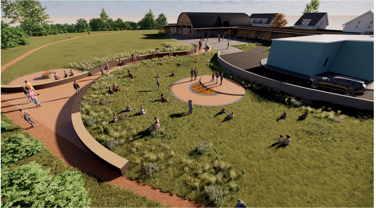
A preliminary design, very much subject to change

Currently in the schematic design phase, the Cannon Beach Elementary School Rejuvenation Project is moving full steam ahead.