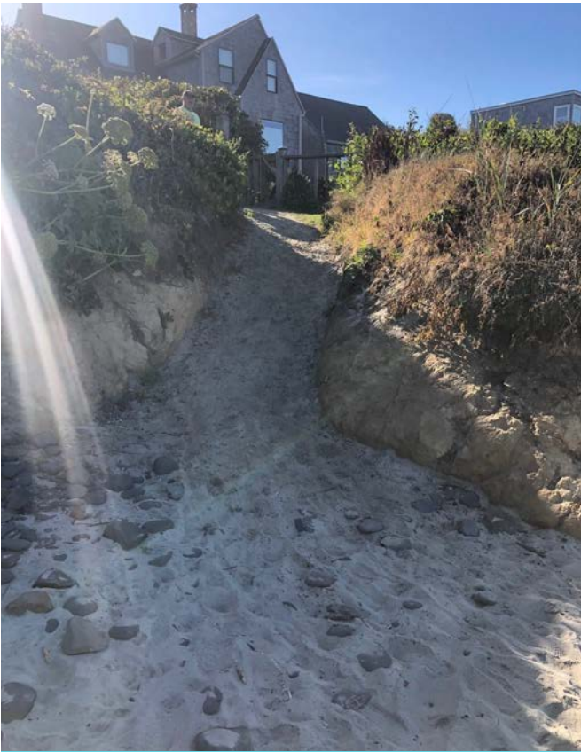
Orford Stairs - Before