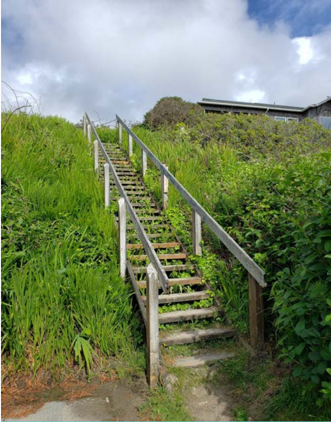
Sitka Stairs From Bottom - Before