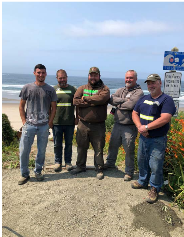
Sitka Stairs Team