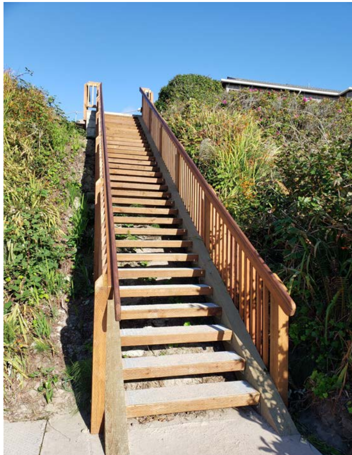
Sitka Stairs From Bottom - After