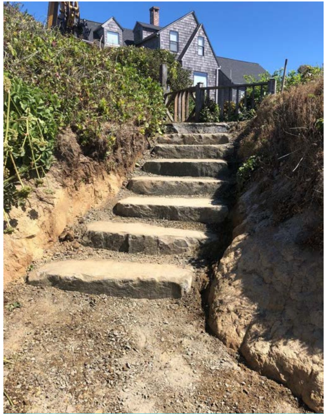
Orford Stairs - After