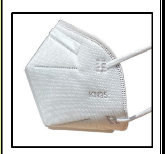
Mask Type (KN95)