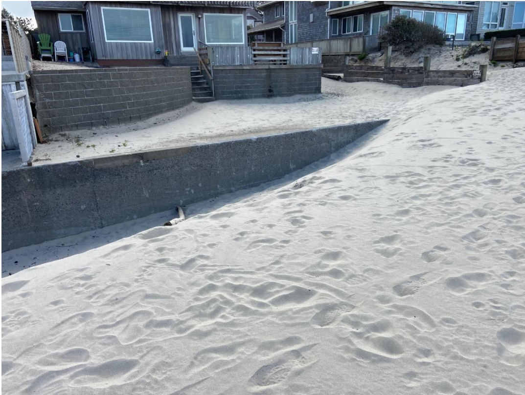
Site Photograph: Project area looking north from S. Pacific St. pedestrian beach access – May 9, 2023