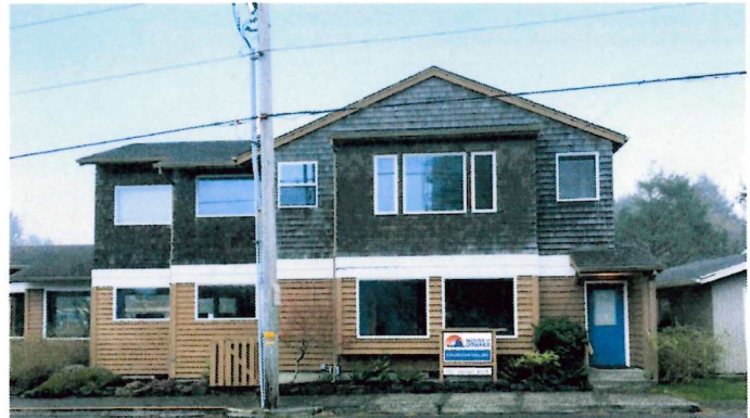
Facing Hemlock 47"x28.5"