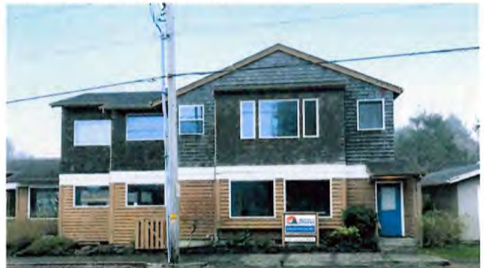
Facing Hemlock 47"x28.5"