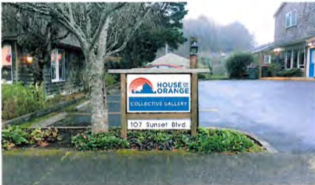
Facing Sunset Blvd 46"x28"