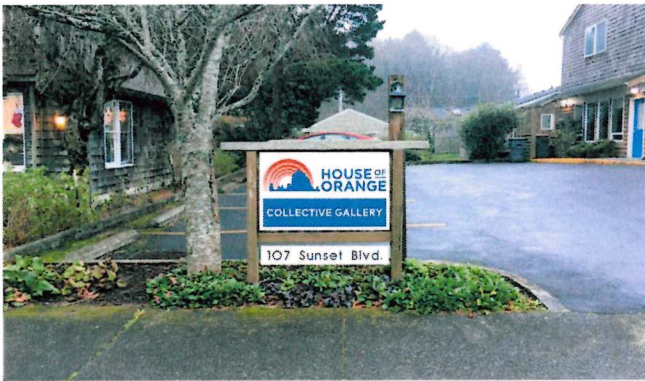
Facing Sunset Blvd 46"x28"