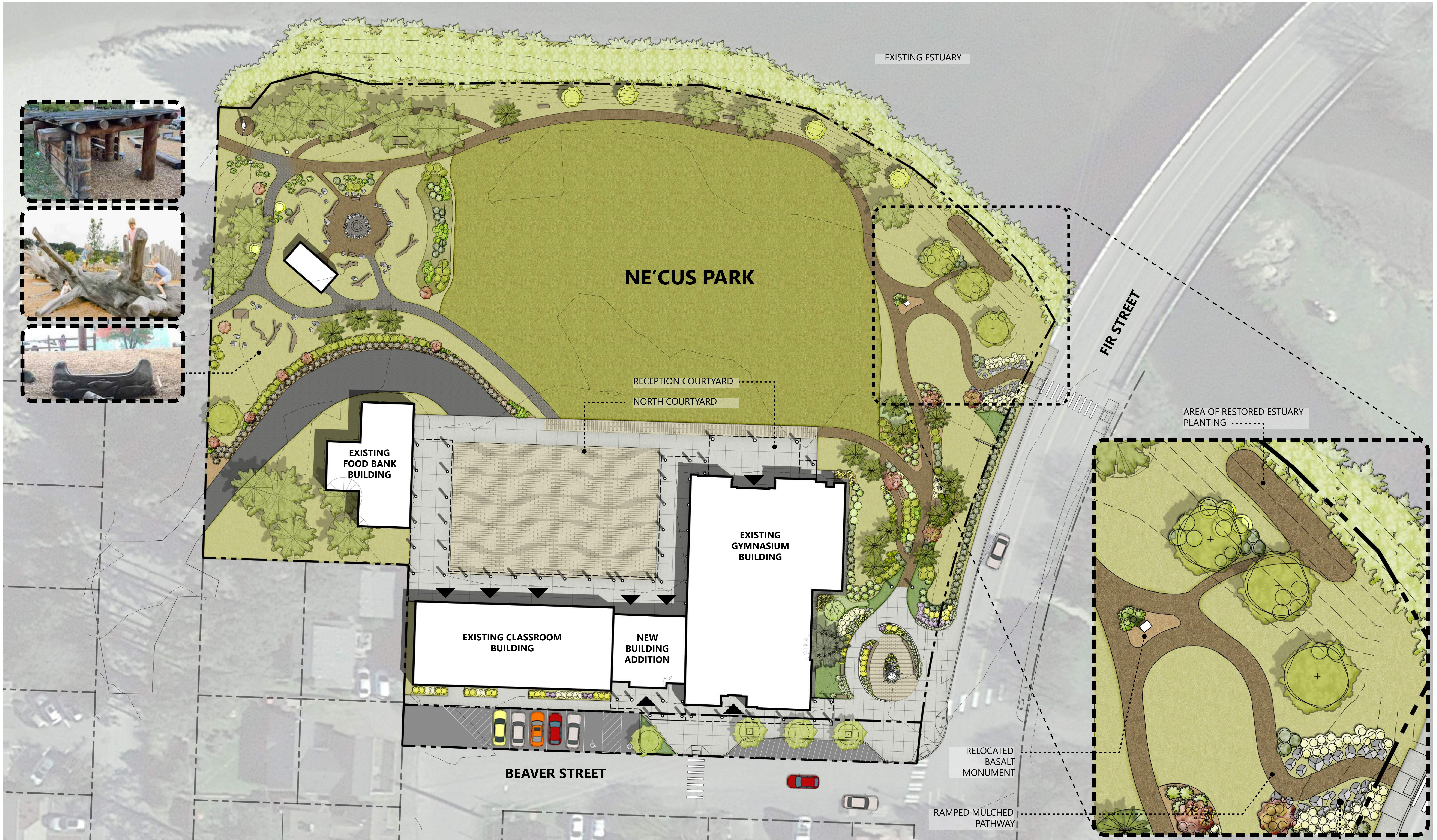
CAMPUS SITE PLAN