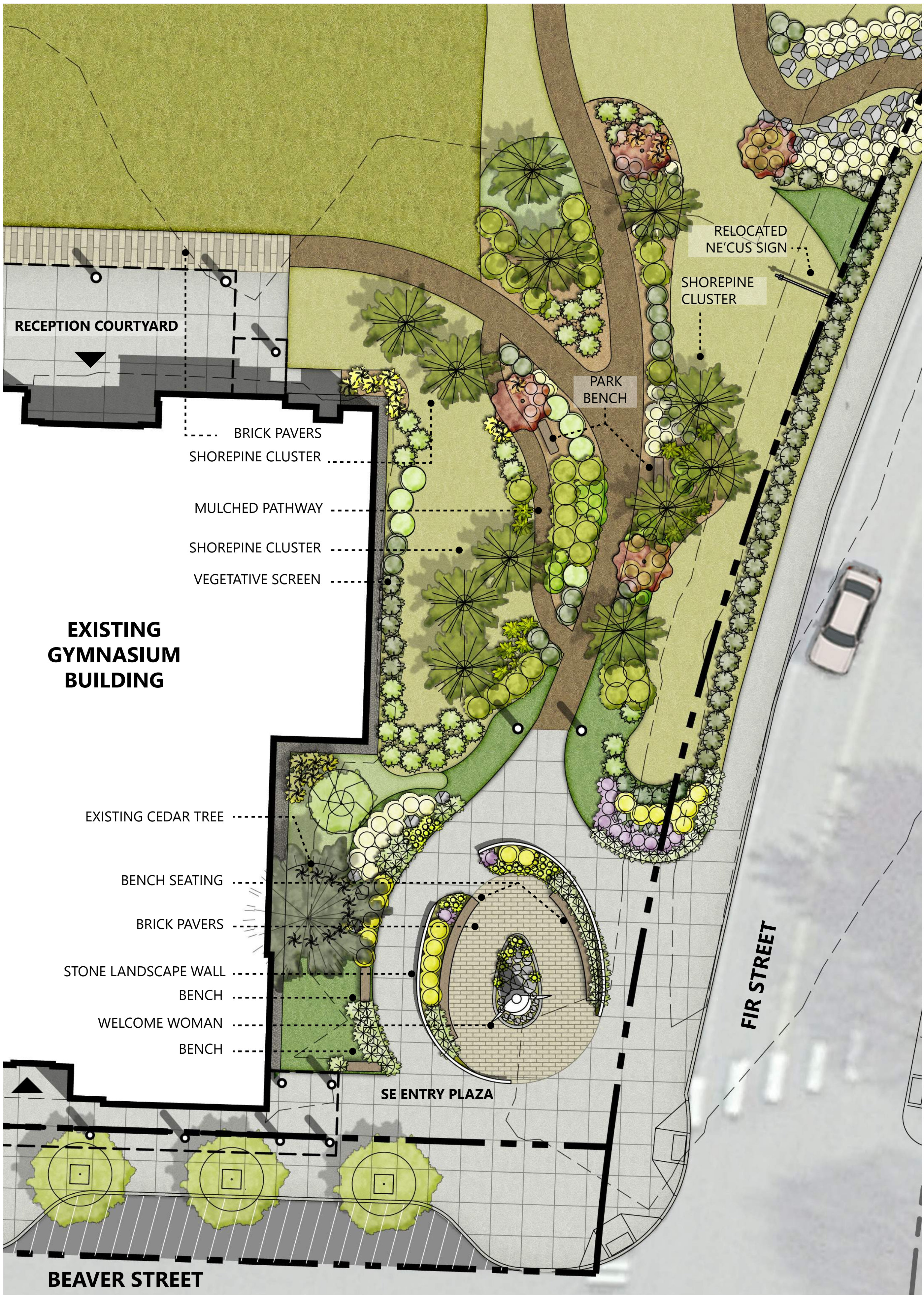
ENLARGED SITE PLAN - SE ENTRY PLAZA