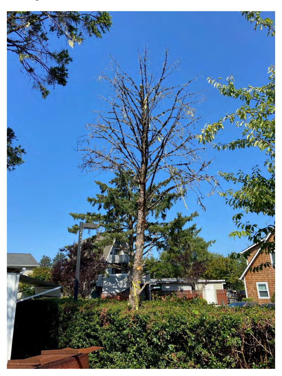
Tree #1: 9-inch DBH Douglas Fir