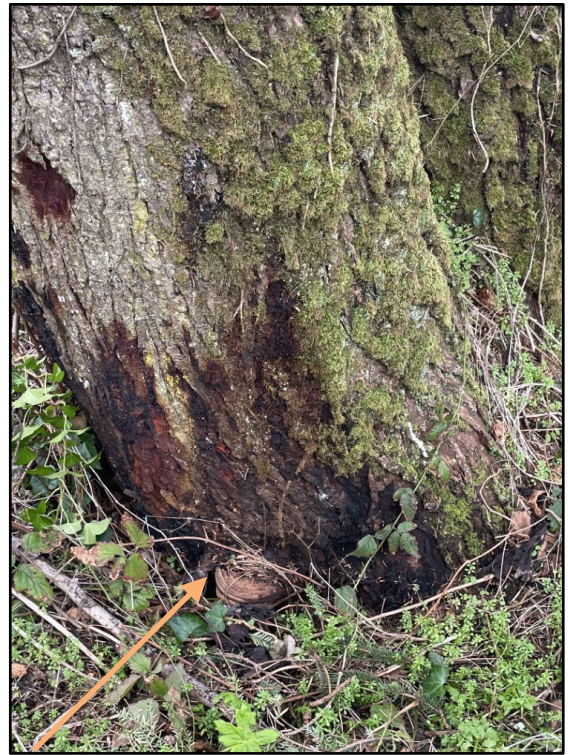
Red-belted conk and staining at base